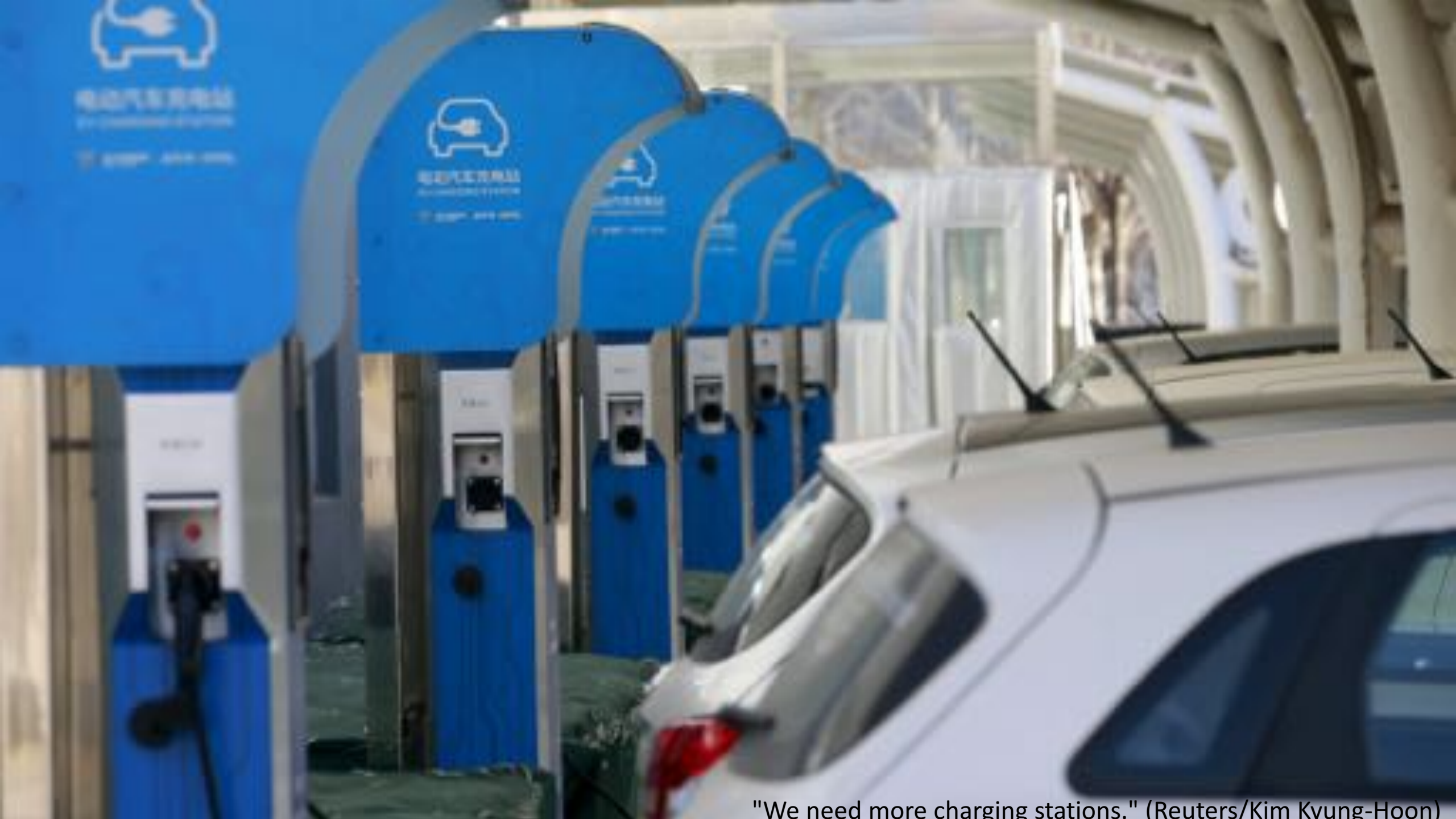
"We need more charging stations."