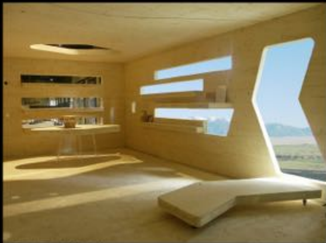
Project Naked House by ABBW