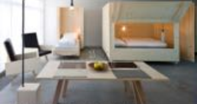
Project: Industrial House by Holly Taylor Studio.