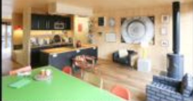
Project: Woodstock House by JPHoto.