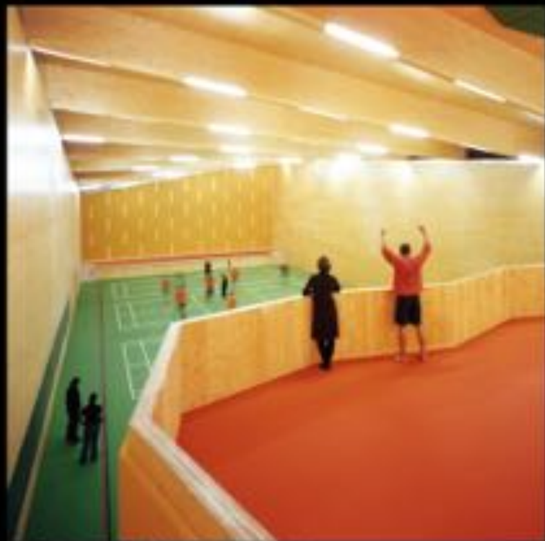
Project Kingdom Social Sports Building by ABBW