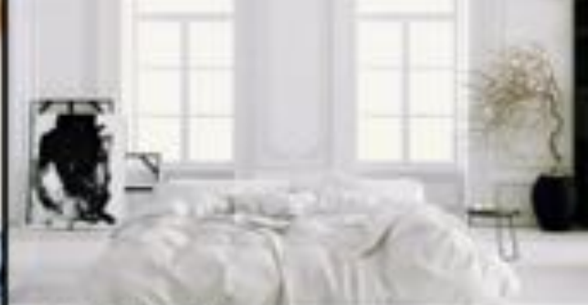
Project: White Bedroom by Sarah & Simonson